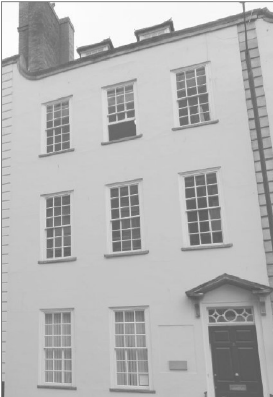
8 Unity Street, Bristol, BS1 5HH